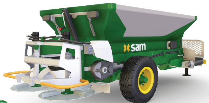
Back view showing spreading discs

2 for 1 with no change-over time! Designed primarily for spreading compost, vermicast, green matter and mulch from the front conveyor. They will also spread fertiliser such as superphosphate, lime and urea through the back-end spinner set up.