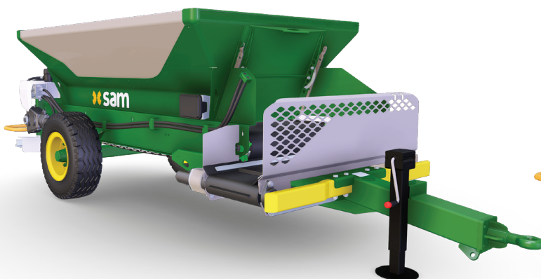
Front view showing banding conveyor

2.5 cubic metre single-axle (top hats available for extra capacity)